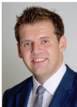
Ben Howlett Member of Parliament for Bath