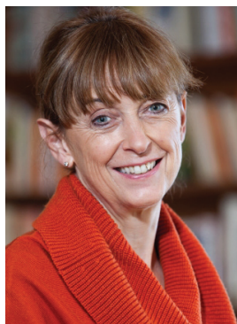
Sue Mountstevens Avon & Somerset Police & Crime Commissioner